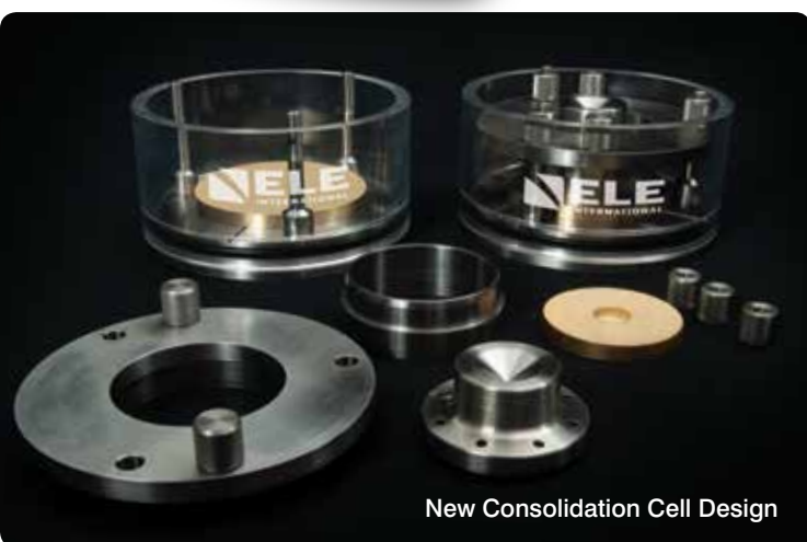
New Consolidation Cell Design

*15 kN S Type Load Cell, 15 mm Displacement Transducer and DS8.0 Consolidation software are not included with the AUTO Soils Consolidator and need to be purchased separately.